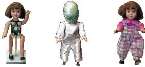
Figure 1.1. The robot has two different appearances used in the trials (the centre figure shows the ‘undressed’ version revealing the robotic parts that control its movement.)

Child C – Age 10, in year 5. C has autism combined with severe learning difficulties. He has no verbal language and uses symbols and signs to make choices and to express basic needs. He will generally have a go at whatever task he is presented with unless he is feeling unwell when his behaviour deteriorates.