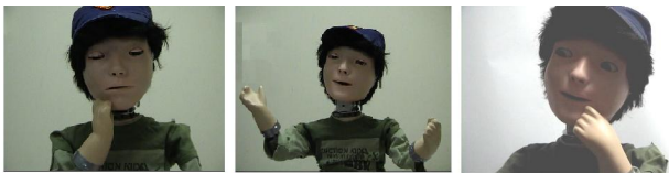
Figure 2 - Some of KASPAR's facial expressions, and expressive gestures

Initial observations of interactions of people with KASPAR indicate that subtle changes in expression coupled with simple gestures is already effective in conveying the message associated to a particular expression. KASPAR's existing facial expressions differ from each other by a minimal change around the mouth opening (see Fig. 1) that also subtly affects the overall face. Together with small changes in the tilt of the head and the direction of the eyes this already creates recognizable expressions (see Fig. 2).