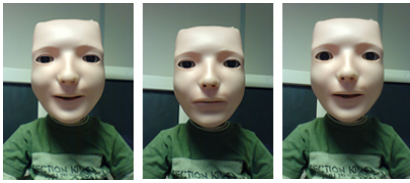
Figure 1 - KASPAR's minimal expressive face

Initial observations of interactions of people with KASPAR indicate that subtle changes in expression coupled with simple gestures is already effective in conveying the message associated to a particular expression. KASPAR's existing facial expressions differ from each other by a minimal change around the mouth opening (see Fig. 1) that also subtly affects the overall face. Together with small changes in the tilt of the head and the direction of the eyes this already creates recognizable expressions (see Fig. 2).